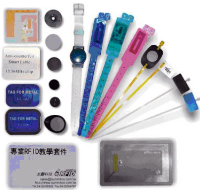
Fig. 1. Various forms of RFID tags (Summit Automation Co., Ltd.)

The tags consist of a microchip (which stores alpha-numerical code for product/fixture labelling), an antenna (copper wire – coil) and an optional power source (e.g. battery). They exist in a variety of forms: various pendants, circular or square plates, magnetic cards, or some other form, depending on the area of application (Fig. 1). Smart labels are a special type of tags which can be placed on, or built into a palette or any sort of product/fixture.