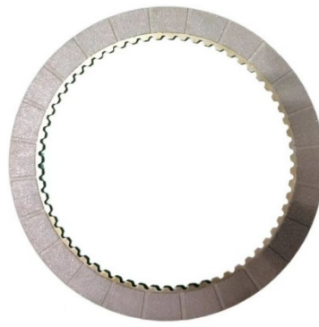
Fig. S4. Radial groove friction plate sample