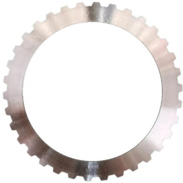
Fig. S3. Dual steel plate test piece

Measurement tests were conducted on the structural parameters of warped dual steel plates. Warped dual steel plates with axial warping amounts of 0.1 mm, 0.2 mm, and 0.5 mm were selected for wet clutch engagement tests and corresponding simulation and theoretical research. The test pieces of the dual steel plates used in the test are shown in Fig. S3, and the friction pair plates are shown in Fig. S4.