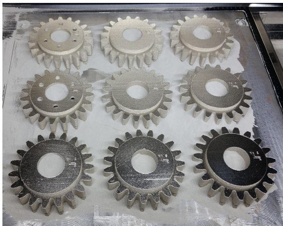
Fig. 1. A set of gears on the building platform after the melting process using the DMLS method

Gears were modelled in several variants of allowance thickness, which resulted from the assumed technological process of gears and compensation for material shrinkage. Prior to melting, pre-production was performed, involving the use of the specialist software EOSTATE Magics RP by Materialise. This stage included preparing the model for the process and setting up the machine according to the manufacturer's recommendations. The preparation of the model included data processing (creating an .stl file of specific accuracy), determining the model's suitable location in the workspace and designing appropriate anchors.